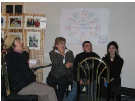
Georgian colleagues on the stage!

"In theatre, you reveal things that you don't by talking, The theatre is a representation of a reality but as a representation it is a new reality ... So theatre is a good laboratory, in which you are more free to go forward, to modify the data, and then try other ways in which you can transform" Augusto Boal