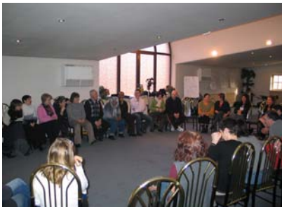
Trainees ready for action!

Participants included staff members of the Norwegian Refugee Council or other field-based partners. About half of the participants were based in Georgia, while the other half came from 12 different countries around the world. Criteria for the selection of participants included the engagement into the planning, development and implementation of training activities in relation to the protection of IDPs.