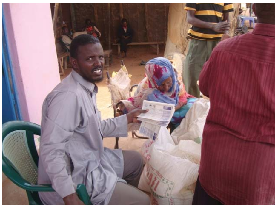
Food voucher project distribution implemented by local NGO ASEP in Gedo region in August.

In August, aid organisations embarked on a strategy to scale up response and to provide increased immediate humanitarian aid to populations in need where they are currently located. The strategy aimed at mitigating the need for