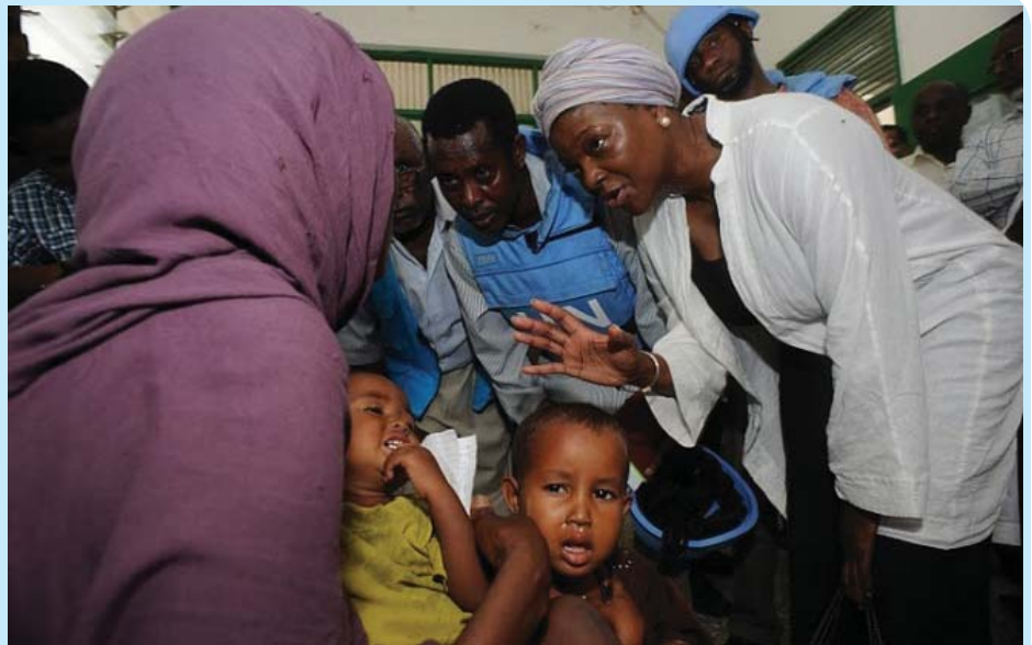
The Under Secretary-General for Humanitarian Affairs and Emergency Relief Coordinator, Valerie Amos speaks to a woman with sick children at the Banadir Hospital during her visit to Mogadishu in Somalia. Banadir Hospital is Mogadishu's main hospital, and one of the only four places in the city where children with acute malnutrition can be treated. In August, the hospital saw a dramatic increase in the number of cases of AWD and cholera. UNICEF and partners continue to provide life-saving treatment for severely malnourished children in 32 Outpatient Feeding Programmes and four Stabilization Centres.

The UN High Commissioner for Refugees Antonio Guterres visited Somalia on 30 August and called for greater efforts to provide life-saving aid to tens of thousands of displaced Somalis inside their country.