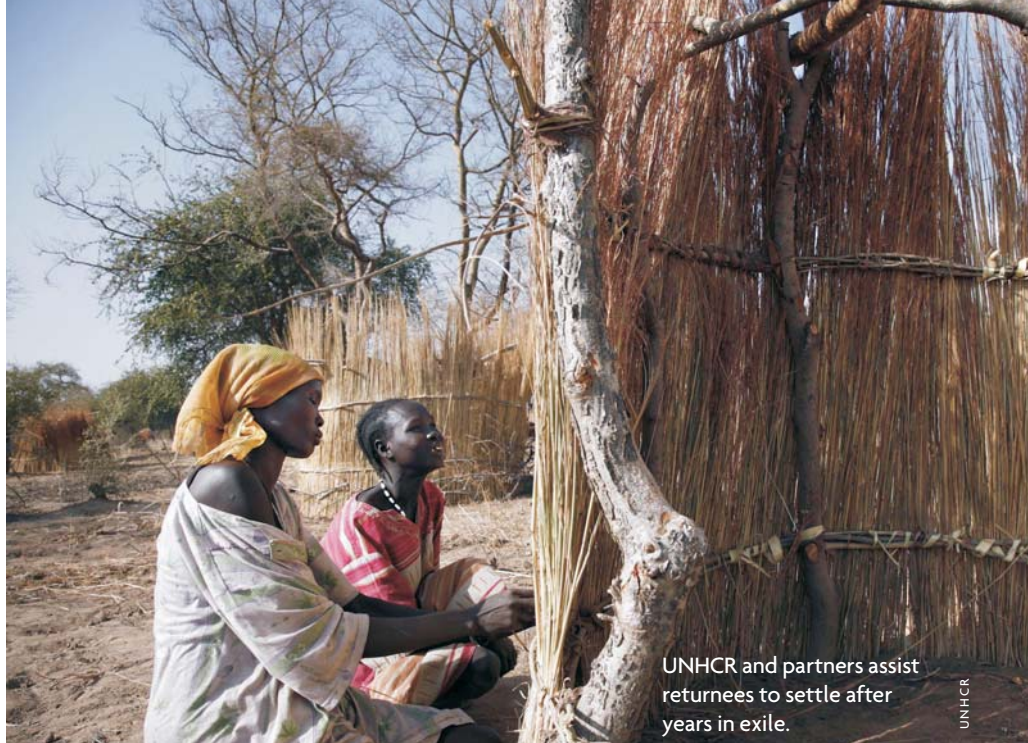
UNHCR and partners assist returnees to settle after years in exile.

AU, Swedish Rescue Services Agency, FAO, ICRC, OCHA, UNAMID, UNDP, UNFPA, UNICEF, UNIDO, UNJLC, UN Mine Action Service, WFP, UNMIS, UNV, WHO