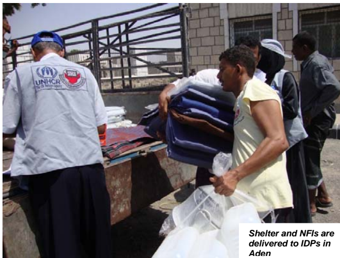
Shelter and NFIs are delivered to IDPs in Aden

Hundreds more are displaced within the city and to neighbouring settlements. Further reports indicated that a medical facility and an ambulance were fired upon, killing a medical staff member. Statements followed from both the UN system in Yemen and the Emergency Relief Coordinator, Valerie Amos, condemning the violence and its impact upon civilians and calling upon all parties for restraint. There has been an increased demand on the health system. The high security risk makes it difficult for medical professionals to report to duty thereby obstructing the delivery of health services.