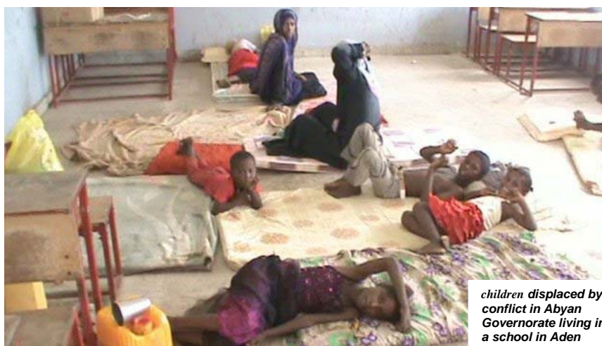
children displaced by conflict in Abyan Governorate living in a school in Aden

The political situation in Yemen remains highly unstable. Renewed conflict has led to a sharp increase in humanitarian needs across the country. An attack on the presidential palace on Friday 3 June injured the president and other senior government officials and sparked fierce conflict between government forces and anti-regime militia in urban areas across the capital.