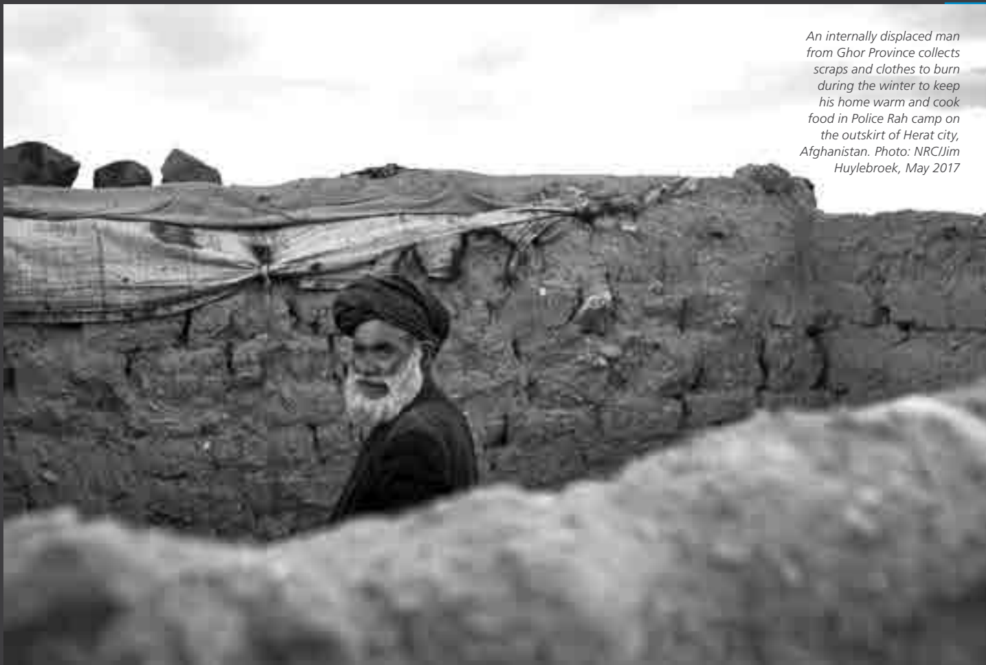
An internally displaced man from Ghor Province collects scraps and clothes to burn during the winter to keep his home warm and cook food in Police Rah camp on the outskirts of Herat city, Afghanistan.

cannot be addressed by humanitarian interventions alone. 179 A shift from humanitarian to development planning, and from national to local implementation is not just a generic recommendation but an urgent priority. 180