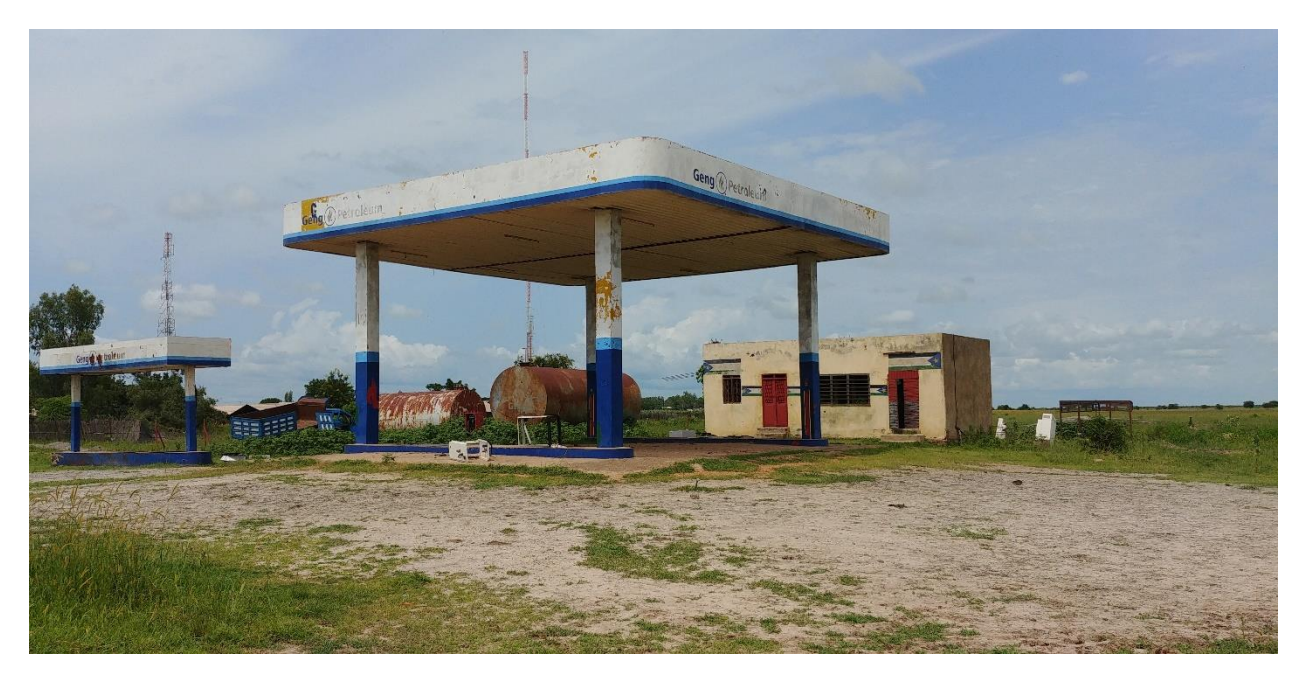
Figure 1 An abandoned petrol station in Bentiu Town

Street lamps and electrical wires that line the main road leading to Bentiu town no longer function but are still visible. Oil revenues also funded the building of a hospital, which served as a regional hub for those seeking medical care beyond basic services often provided by local clinics.