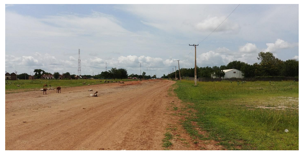
Figure 2 Electrical wires line the main road but no longer function

Street lamps and electrical wires that line the main road leading to Bentiu town no longer function but are still visible. Oil revenues also funded the building of a hospital, which served as a regional hub for those seeking medical care beyond basic services often provided by local clinics.