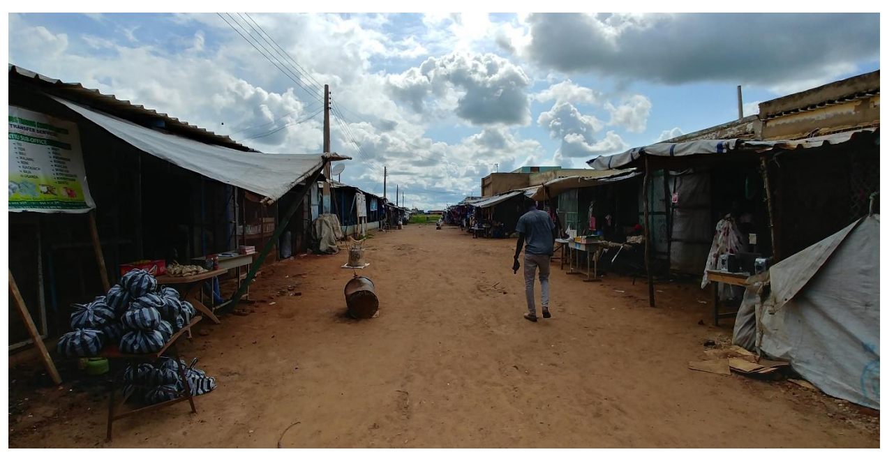
Figure 4 Market in Bentiu Town

However, the destruction of facilities and services since then brought this designation into question. At the same time, there were clear distinctions between the markets, services and infrastructure in Bentiu and Rubkona towns, and what is currently available in the rural areas across the rest of Unity State. For the PoC site, the fact that it was perceived to be a manufactured site that was intended to be temporary in nature, designed specifically for those that had been displaced, made it questionable to interviewees as to whether it could be considered an urban area despite the concentration of the population and services there.