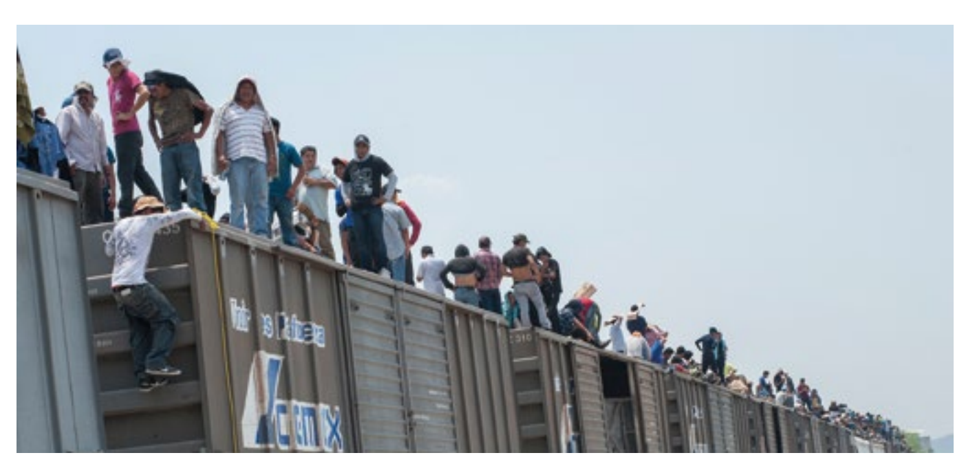
After entering Mexico illegally near Ciudad Hidalgo on their way to the US border, many Central and South American migrants continue their journey on the freight train known as La Bestia, the Beast. Photo: IOM/Keith Dannemiller, April 2014

These analyses will be validated with quantitative empirical data, but they will also require significant qualitative information, including the anonymised interview transcripts and profiling data that agencies collect at different points of transit and arrival, but which are not currently shared consistently. These exercises need to be prioritised, expanded and adequately funded to increase their coverage and allow for the collection of more data over longer periods of time.