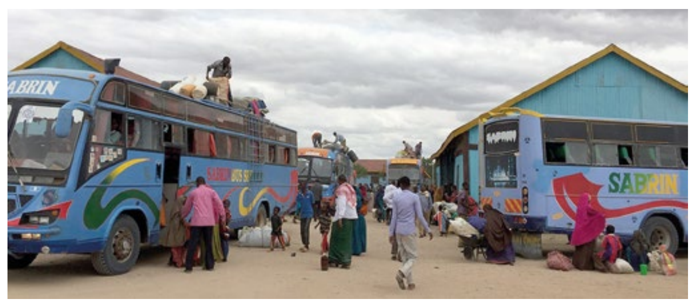
It is a bee-hive of activity at the Dhobley Way Station, Somalia, where returnees are expected to register before they can proceed to their final destination.

An evidence base that provides better quantitative and qualitative understanding of the entire displacement continuum, from the drivers of onward movements across borders to return processes, is vital at this juncture. It would allow governments, policy-makers and responders on the ground to better meet displaced people's immediate protection and assistance needs at their points of departure, transit and arrival. This in turn has the potential to strengthen systematic approaches to preparedness and response, and to address the long-term political and development challenges brought about by unresolved and protracted internal displacement.