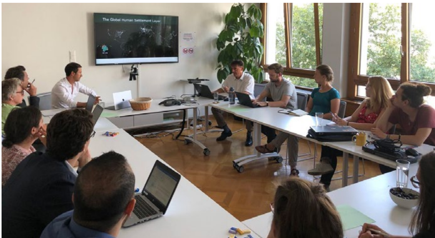
IDMC hosts the ECJRC's presentation of the new Global Human Settlement Layer. Photo: IDMC, July 2018