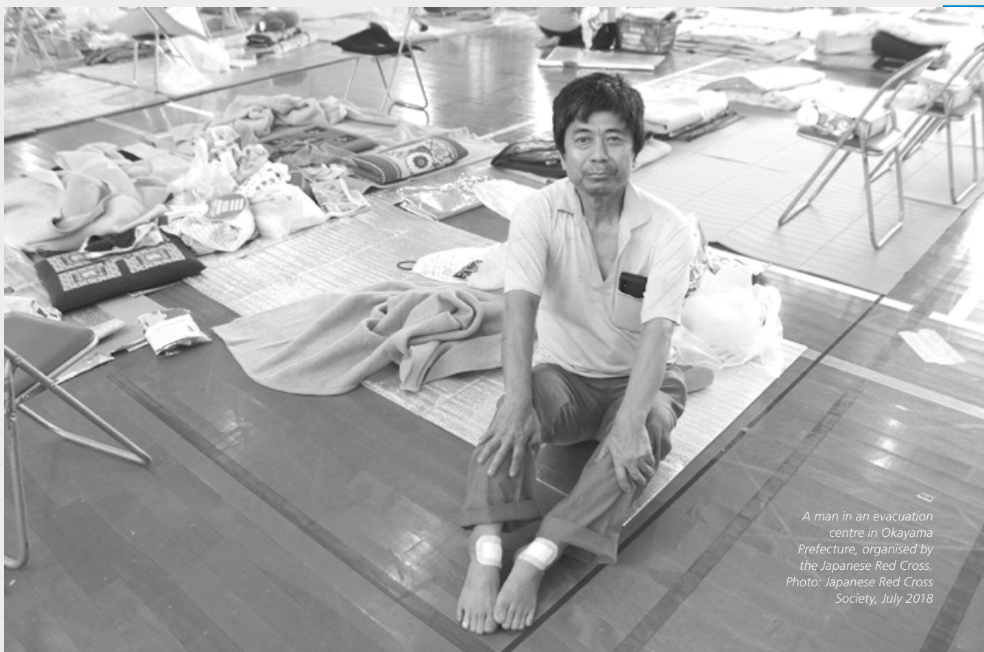
A man in an evacuation centre in Okayama Prefecture, organised by the Japanese Red Cross. Photo: Japanese Red Cross Society, July 2018

to rely on humanitarian assistance for food and non-food items. 144