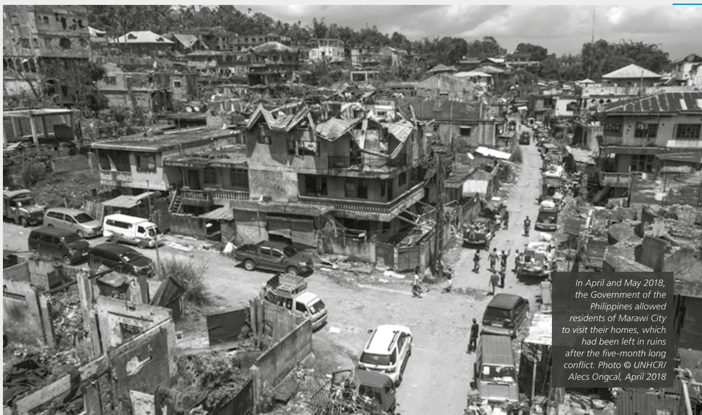
In April and May 2018, the Government of the Philippines allowed residents of Marawi City to visit their homes, which had been left in ruins after the five-month long conflict. Photo © UNHCR/ Alecs Ongcal, April 2018

in to retrieve what they could from the rubble of their homes before the area was cordoned off. It remains uninhabitable, and reconstruction will not begin until the debris has been cleared and roads rebuilt, which is expected to take at least 18 months. 149