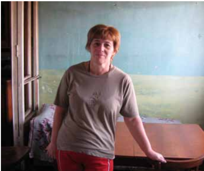
An internally displaced Georgian in Kutaisi. (IDMC, 2009)

IDMC advocated for innovative long-term housing solutions for IDPs during a meeting it convened on the sidelines of the annual OSCE Human Dimension Implementation Meeting in Warsaw in September. Preliminary findings of IDMC research, presented to delegations of 12 countries, 13 national NGOs and OSCE representatives, informed the conclusions which found that: adequate housing is just one component of durable solutions; housing practices in Georgia and Serbia might be replicated elsewhere in the region; states should reaffirm and implement their commitments to IDPs; and the OSCE should hold states accountable to their commitments.