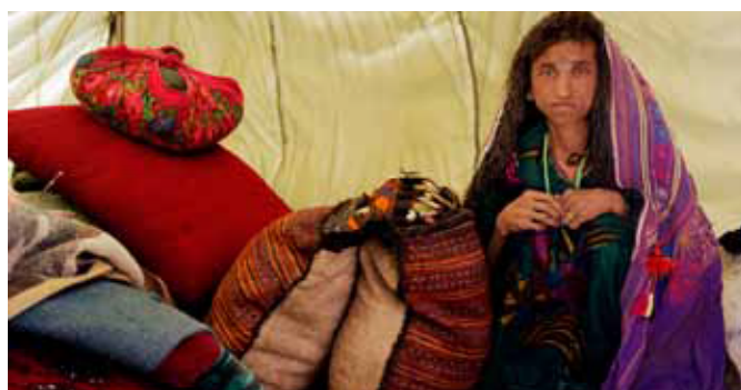
An internally displaced woman waits for a relative to carry her belongings to her tent in a Emergency Response camp in Herat province of Afghanistan, June 2012.

In September, IDMC participated in an expert workshop in Geneva on internally displaced women convened by the UN Special Rapporteur on the Human Rights of Internally Displaced Persons. The event was an opportunity both to discuss challenges faced by internally displaced women and to suggest recommendations to the Special Rapporteur, who chaired the event together with the Brookings-LSE project on internal displacement. IDMC, along with UNHCR, was invited as a keynote speaker and presented protection issues faced by IDP women brought into focus by its research in Burundi, eastern Chad and Pakistan. It also highlighted the need for IDP protection needs assessments to include data disaggregated by sex, age and location.