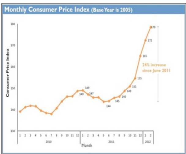
OCHA February 2012

In the meantime peaceful protests calling for regime change and better socio-economic justice have considerably increased from 51 street protests on Friday 17 June 2011, to 493 on Friday 6 June 2012 and to 939 on Friday 1 June 2012