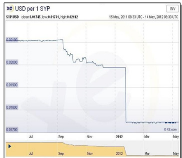
Syrian pound official exchange rate from May 2011 to May 2012

The Syrian pound began to depreciate in September 2011 and plummeted in value on 24 January. This has added an enormous burden on the population as a whole and particularly on the displaced, many of whom have lost their livelihoods. A combination of drought, the current economic hardships and insecurity has hit Kurdish farmers in the north hard, forcing around 18,000 families into secondary displacement (IRIN, 17 February 2012).