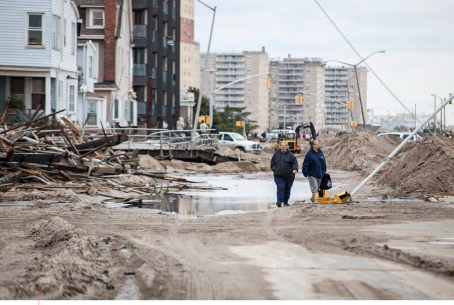
Residents survey the scene on Long Island, New York following Hurricane Sandy. November 2012

The displacement disasters cause increases their vulnerability to human rights violations still further. They may face discrimination on the basis of their tenure status, in that they may be ineligible for reconstruction assistance if they do not own their land or home, and they may be exposed to forced eviction and unjustified or inadequate relocation if their settlement is declared unsuitable for reconstruction. Urban IDPs forced to flee again by a disaster face similar challenges, often made worse by their illegal presence in a settlement and their lack of documents proving residence.