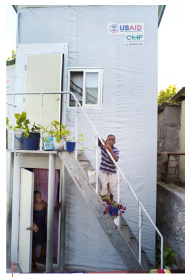
Residents in new housing in Ravine Pintade, a hilly area in the center of Port-au-Prince which was previously damaged by the earthquake. An extra floor was added to address the small size of the plots. Photo: CHF/Maggie Steber, May 2012

The Nansen principles build on the Human Rights Council 2009 report, which explores the link between disasters and human rights. As mentioned above, the report examines the impact of climate change and disaster-induced displacement on the enjoyment of specific rights and on vulnerable groups, and ways in which it contributes to forced displacement and conflict.<sup>61</sup>