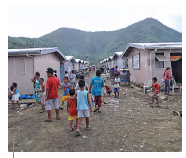
Life inside the International Pharmaceuticals Inc. bunkhouse community in Tacloban, one of the biggest cities affected by Haiyan.

The government initially recommended the establishment of a blanket no-build zone stretching 40 metres