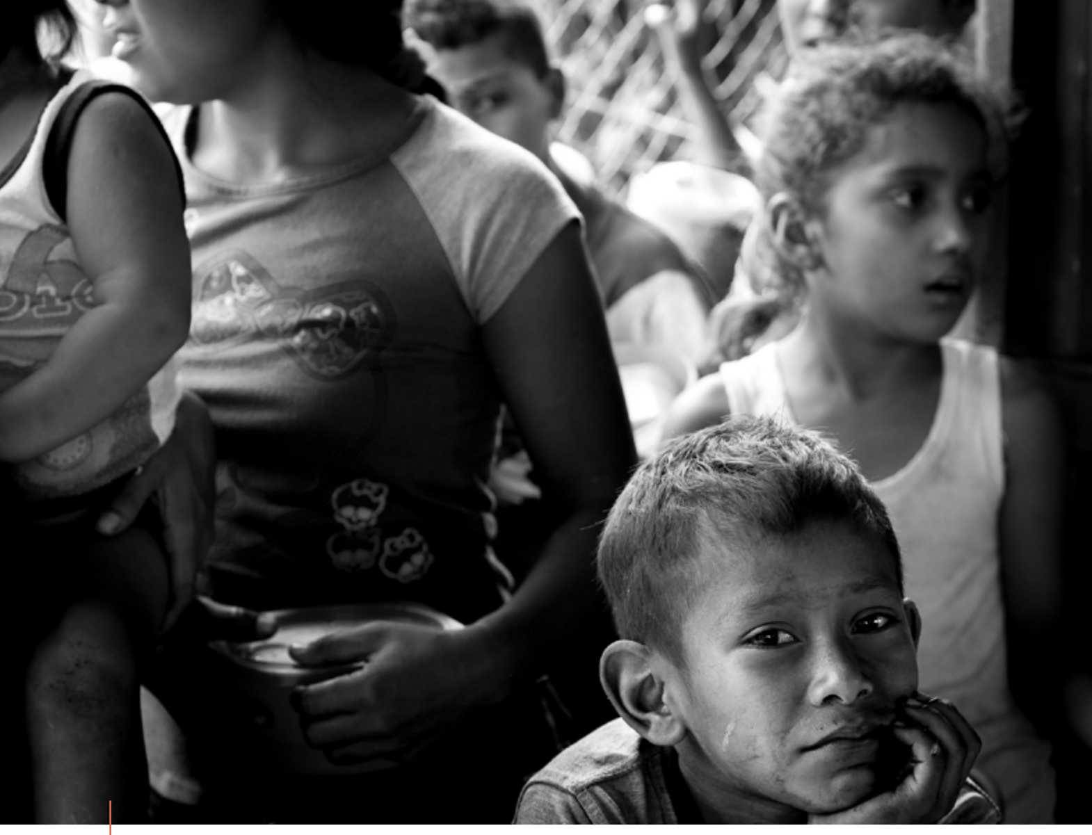
Displaced villagers from Hurricane Mitch now living in the Chinnidaga Dump. Photo credit: Jana Allingham, November 2014. https://flic.kr/p/pUe5Sa

ment partners, international organisations showed little interest in the barrio project and preferred to develop their own programmes.