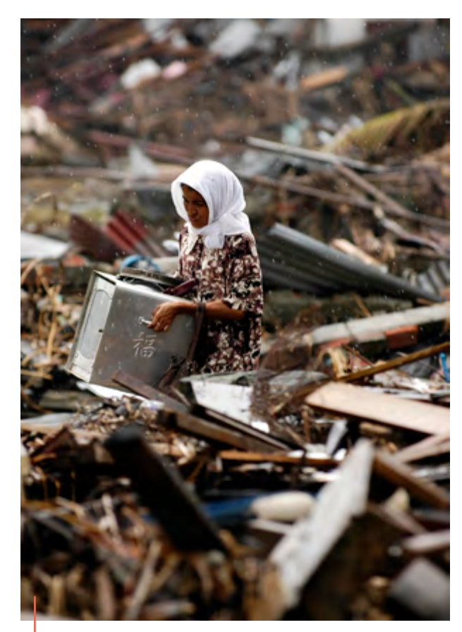
An Indonesian woman searches through debris in the rain, where her house once stood, in the city of Banda Aceh on the island of Sumatra, Indonesia. Photo credit: US Navy/Jordon R. Beesley, January 2005

The case study illustrates the need to facilitate durable solutions for displaced informal settlers that take social cohesion and access to livelihoods into account. It shows that cash grants are in this case used as a short time