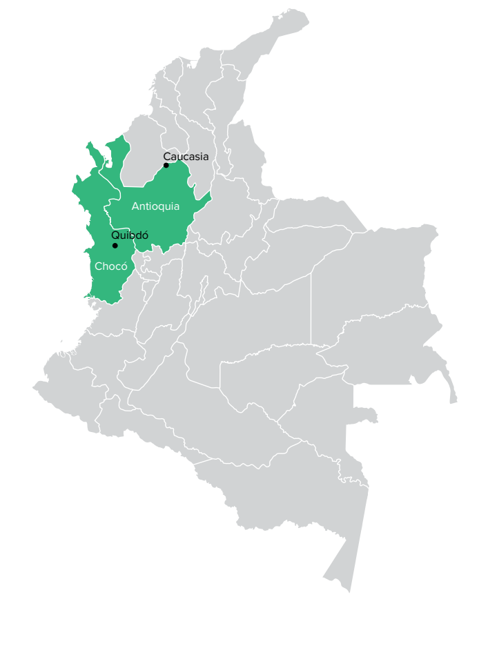
Map 1: Study locations in Colombia

"Maybe armed groups find it more convenient (...). There is less media coverage, less push back and less pressure from the army. If mass displacement occurred again, there would be a greater chance of confrontation." – Representative from the African-Colombian community in Quibdó.