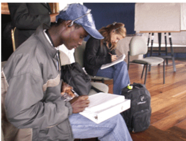
Participants in the Life History workshop in Bogota, Colombia

The IDP Network page can now be viewed in three languages: English, French and Spanish. By establishing the IDP Network, the IDMC seeks to provide a platform for IDP communities to express their views and needs, and exchange lessons learned and best practices in responding to situations of internal displacement. The Network currently has 24 members and continues to grow.