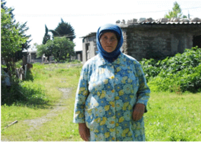
Displaced woman in Georgia

In early June, the IDMC conducted a two week mission in Kenya to assess the situation of IDPs in the country. The mission will result in a special report, which will make recommendations to the UN and the government on how the broader humanitarian community in Kenya can address the situation of roughly 400,000 IDPs.