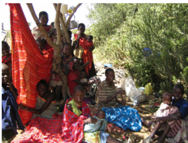
IDPs in Sukuta Lol Marmar, Samburu District, Kenya.

The Quarterly Update should be read along with the 2006 Annual Appeal, which outlines the main objectives, activities and financial needs for the year.