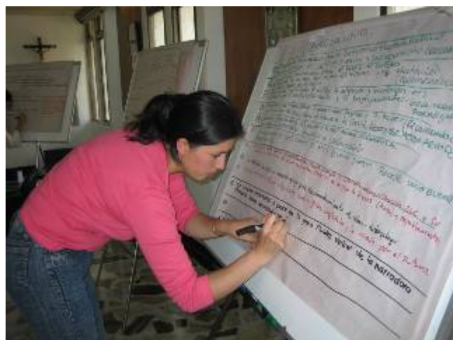
Participant in the Life Story Project, Colombia.

"It's a great effort to give voices to those who have been silenced and crushed as effects of the armed conflict, and it's extremely positive to create motivated groups to work on this."