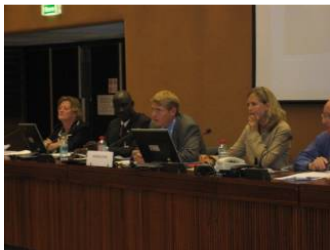
IDP Session at UNHCR Annual Consultations, chaired by IDMC.

NGOs preceding the yearly meeting of UNHCR's Executive Committee. The IDP session this year focused on the implementation of the cluster approach in situations of internal displacement, using Uganda as an example.