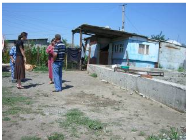
In North Ossetia, IDMC Country Analyst for Russia in discussion with a displaced family about new house construction.

The IDMC Country Analyst for Russia travelled with NRC's Programme Coordinator and Protection and Advocacy Advisor to the Russian Federation from 22 to 29 June 2007.