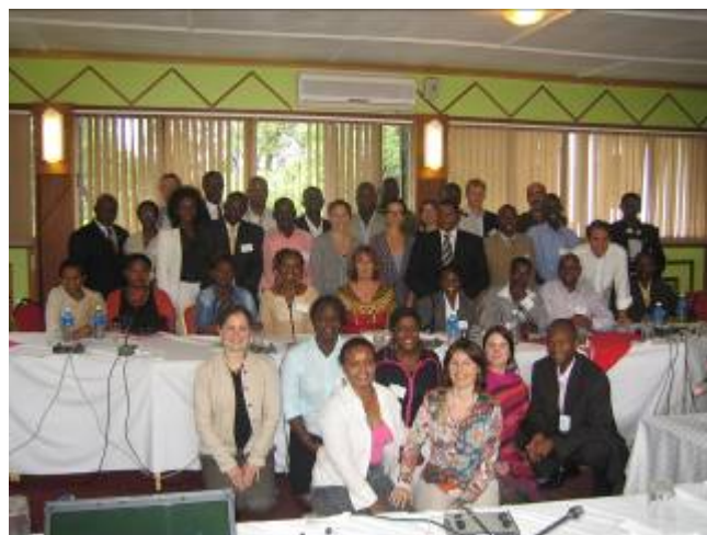
“Enhancing Protection of Displaced Populations: Translating the Great Lakes Peace Pact into Action” : participants at the workshop (Photo: IDMC. April 2007)

enhance the rights of refugees and IDPs. The workshop, entitled Enhancing Protection of Displaced Populations: Translating the Great Lakes Peace Pact into Action was attended by 25 civil society groups from the region, and the Canadian High Commissioner to Kenya was a keynote speaker at the workshop's reception.