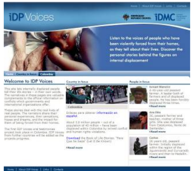
A screenshot of the newly-launched IDP Voices website, hosting life stories of the displaced in Colombia.

It is impossible to really understand forced displacement without listening to stories of real people in their own words. The website idpvoices.org was launched alongside the book on 27 June, and gives visitors a chance to grasp the impact of the conflict at first hand, and appreciate the extraordinary courage of people determined to let the world know what happened to them.