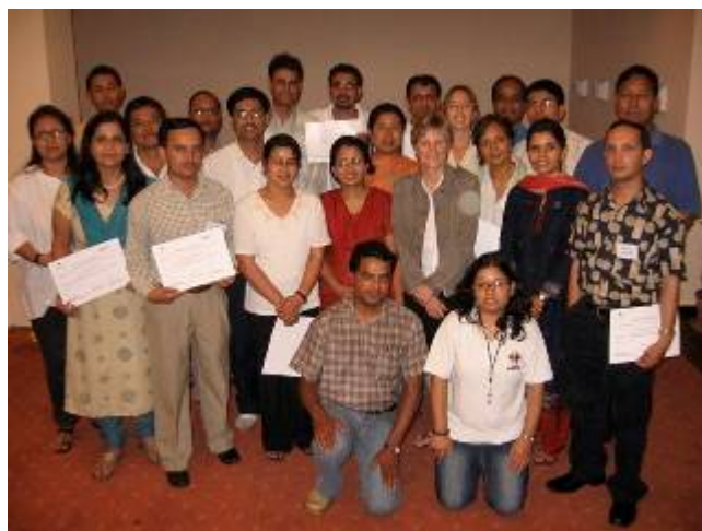
Newly qualified trainers receive their certificates at the end of IDMC training in Nepal (Photo: NRC, May 2007)

a "training of trainers" (ToT) course on the protection of IDPs.